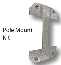
Pole Mount Kit