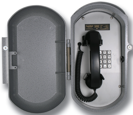
ACT-30 Cast Aluminum with Curly Handset Cord

ACT Series Cast Aluminum Telephones are designed to connect to any standard telephone network. To maintain safety standards, the use of electrical conduits and adherence to local codes may be required. Telephones are set for standard DTMF tone dialing, but may be set up for 40/60 pulse operation if required. To maintain voice quality, a telephone should be connected within 15,000 ft. (~4,600 meters) of a main telephone switch which accepts single line telephones.