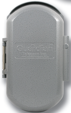
ACT-40 Cast Aluminum with Armored Handset Cord