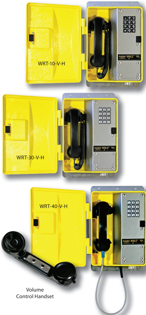
Volume Control Handset